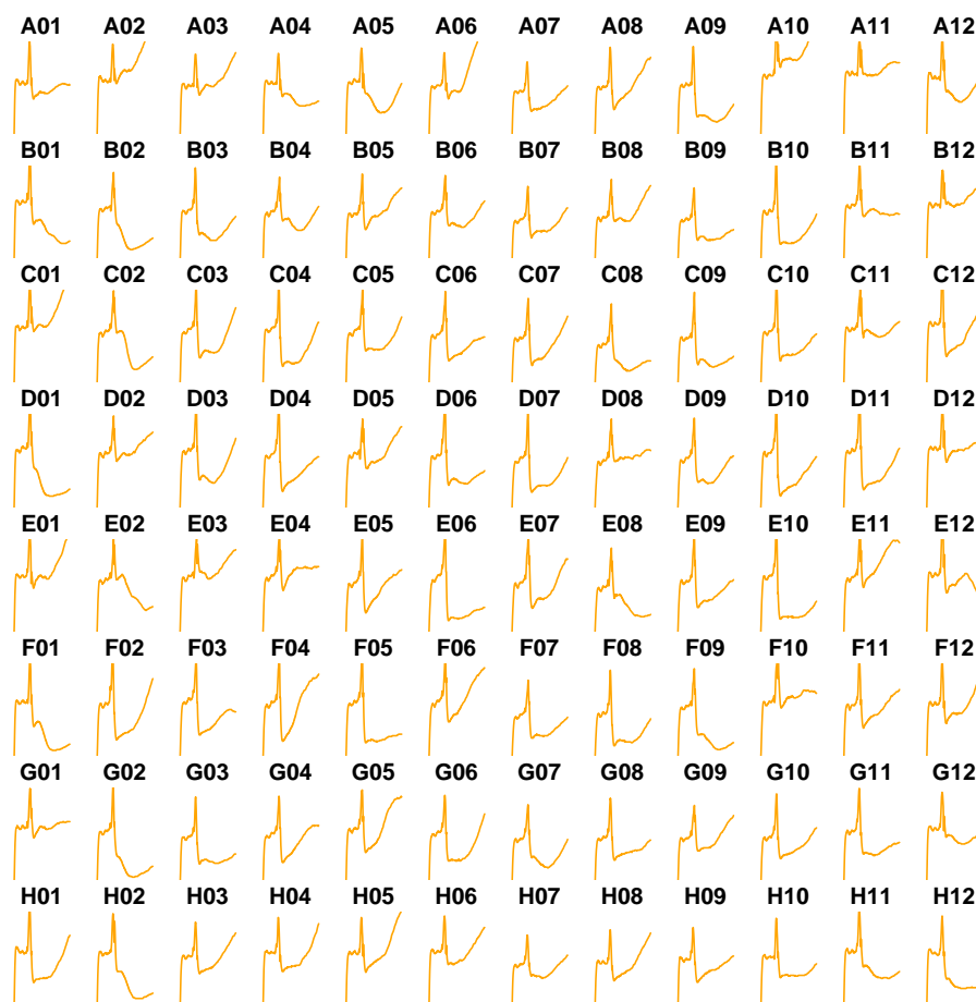
Figure 3: Plate view of a 96-well E-plate from a RTCA assay run.